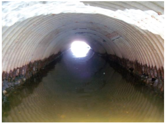
Black Wolf Avenue at RR Crossing South End

The replacements will take place during summer or early fall of 2015. I also expect to be applying for culvert aid to replace the cross road culvert on Black Wolf Avenue at the RR crossing. The culvert is rusting out at the water level and creating a sink hole due to erosion. The replacement should happen in 2016.